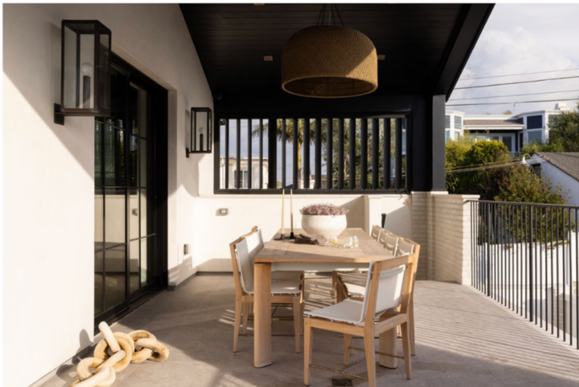
The home is designed to offer choices for indoor-outdoor gatherings.