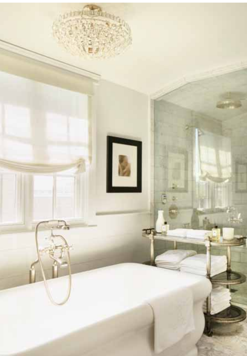
A Visual Comfort ceiling fixture illuminates the master bathroom, which features a Hydro Systems tub paired with a Kohler tub filler. Carrara marble lines the glassed-in shower; the owners' towel caddy stands just outside.