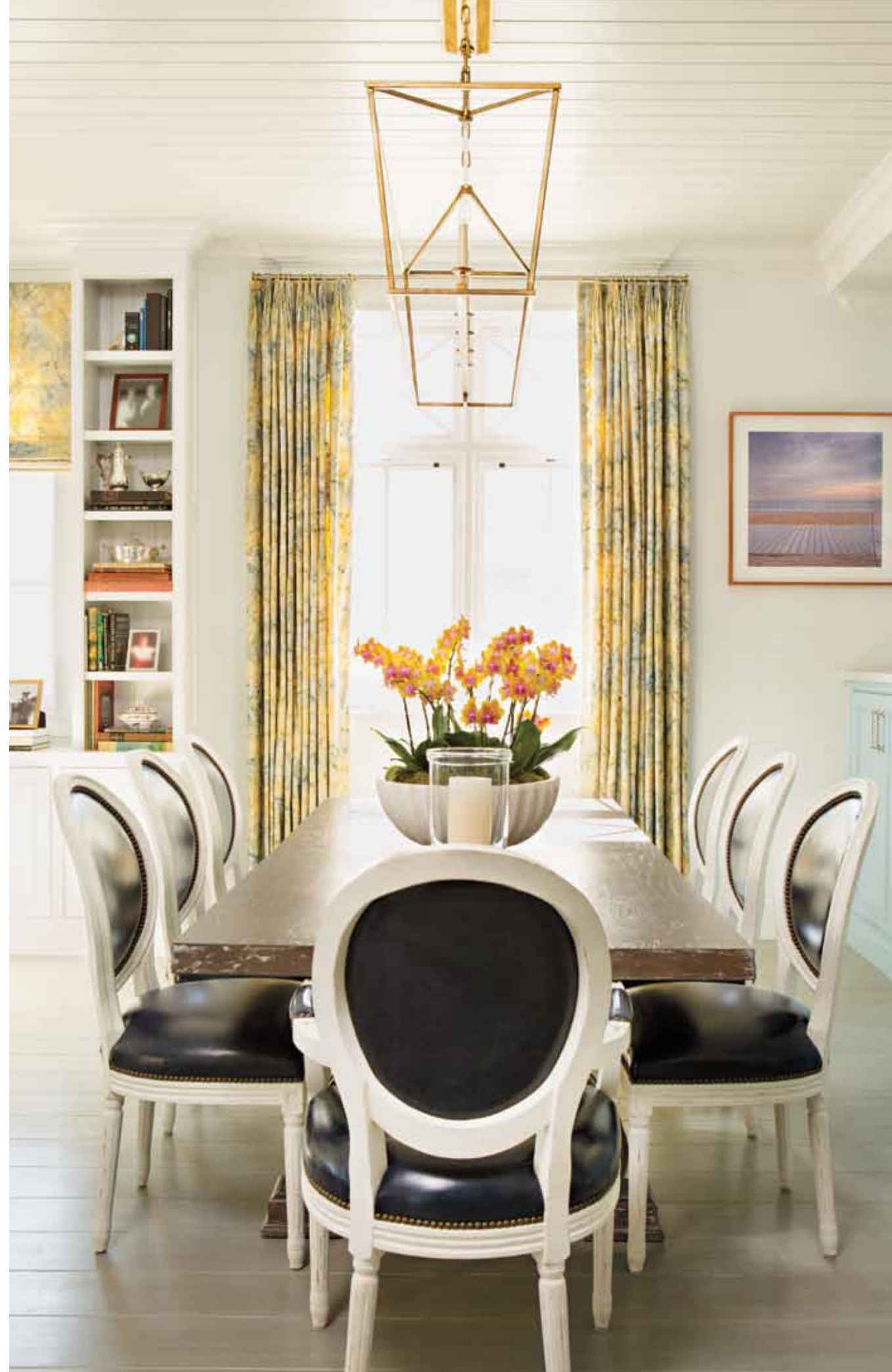
The dining area stands in the center of the floor's open plan devised by architect Doug Leach and features chairs from Restoration Hardware covered with a navy United Leather textile. A Visual Comfort pendant illuminates the space.