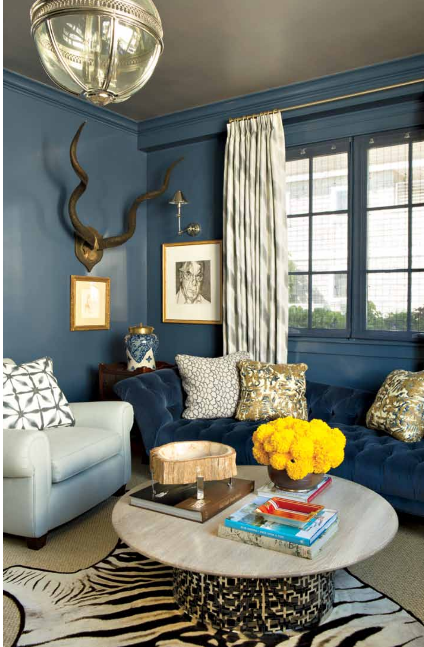
A Jonathan Adler coffee table and Restoration Hardware pendant play off the library's lacquered walls. Draperies made with a Kelly Wearstler for Groundworks fabric frame the window, while a tufted sofa, recovered with a rich velvet by Scalamantré, sits below.