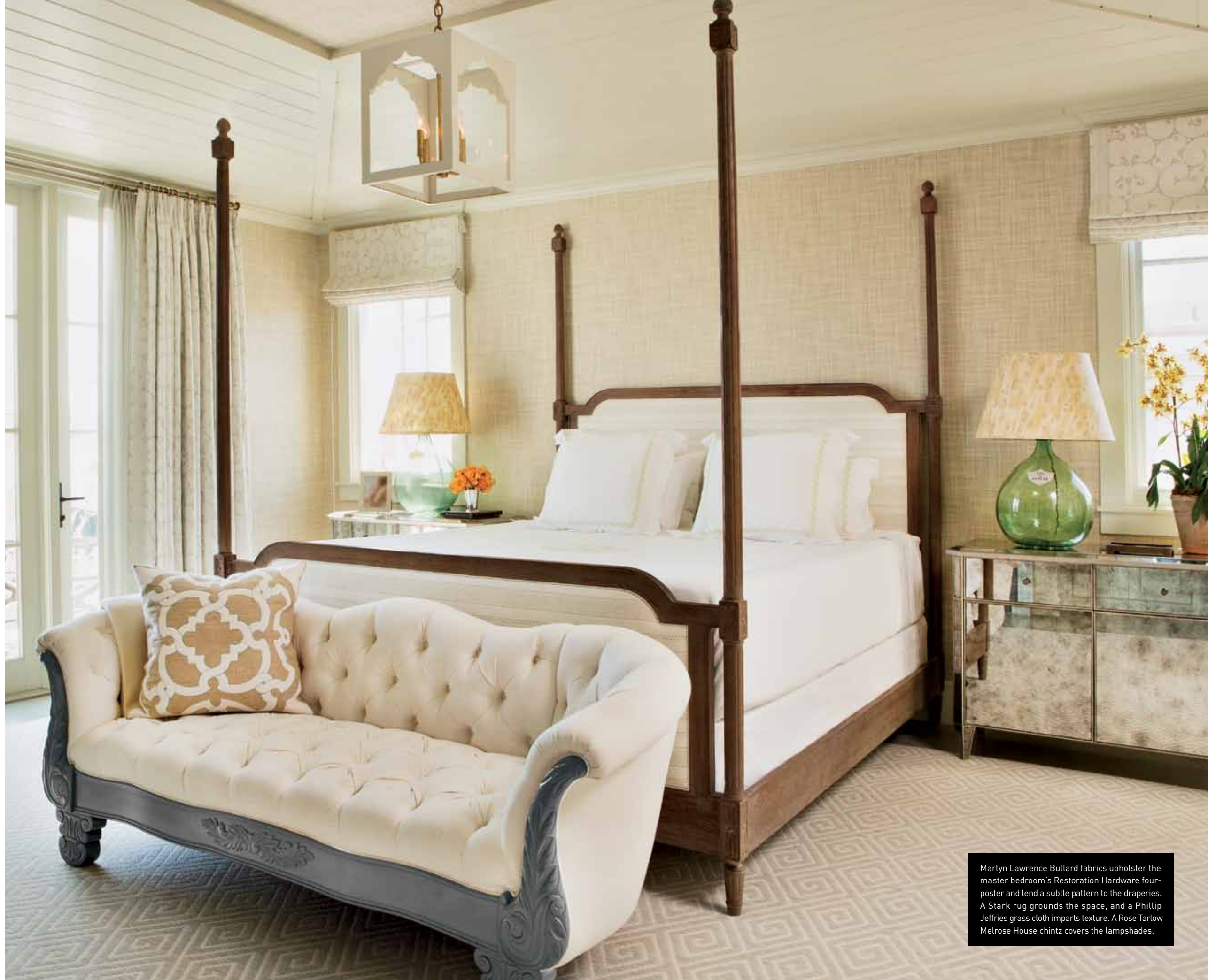
Martyn Lawrence Bullard fabrics upholster the master bedroom's Restoration Hardware four-poster and lend a subtle pattern to the draperies. A Stark rug grounds the space, and a Phillip Jeffries grass cloth imparts texture. A Rose Tarlow Melrose House chintz covers the lampshades.

The updated classic feel reverberates throughout the house and rings true with the family. "It's the perfect house for us," the wife says. "And everyone who walks in mentions how happy it feels." L