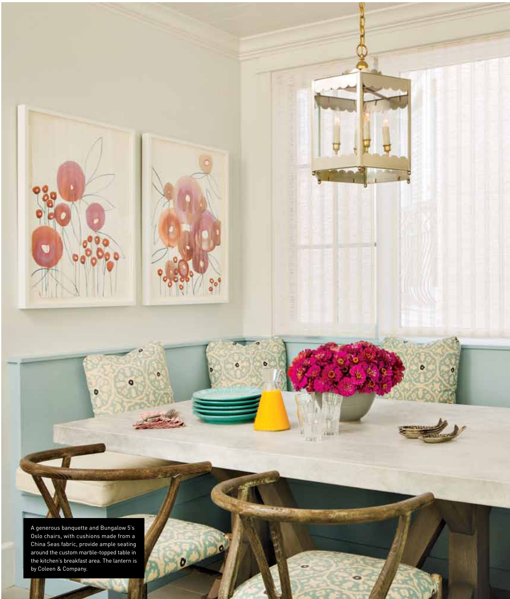
A generous banquette and Bungalow 5's Oslo chairs, with cushions made from a China Seas fabric, provide ample seating around the custom marble-topped table in the kitchen's breakfast area. The lantern is by Coleen & Company.